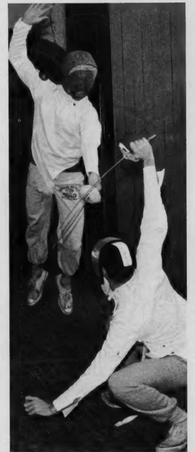
Two mighty muskateers prepare for sizzling season.